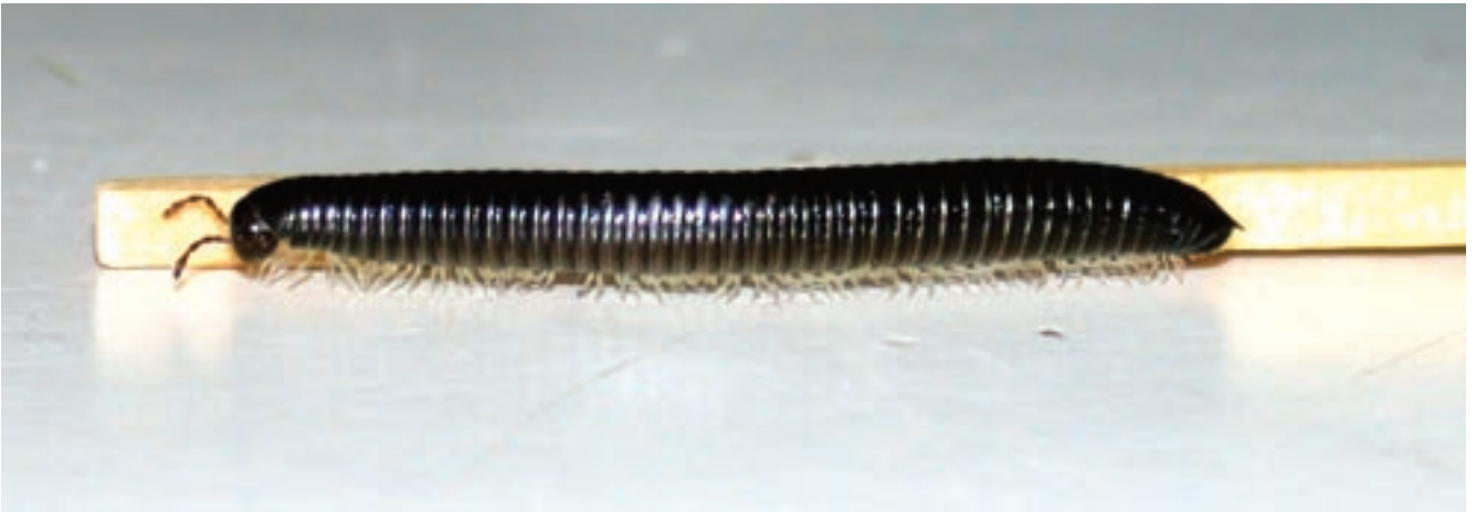
Figure 3. Uncoiled millipede in motion.