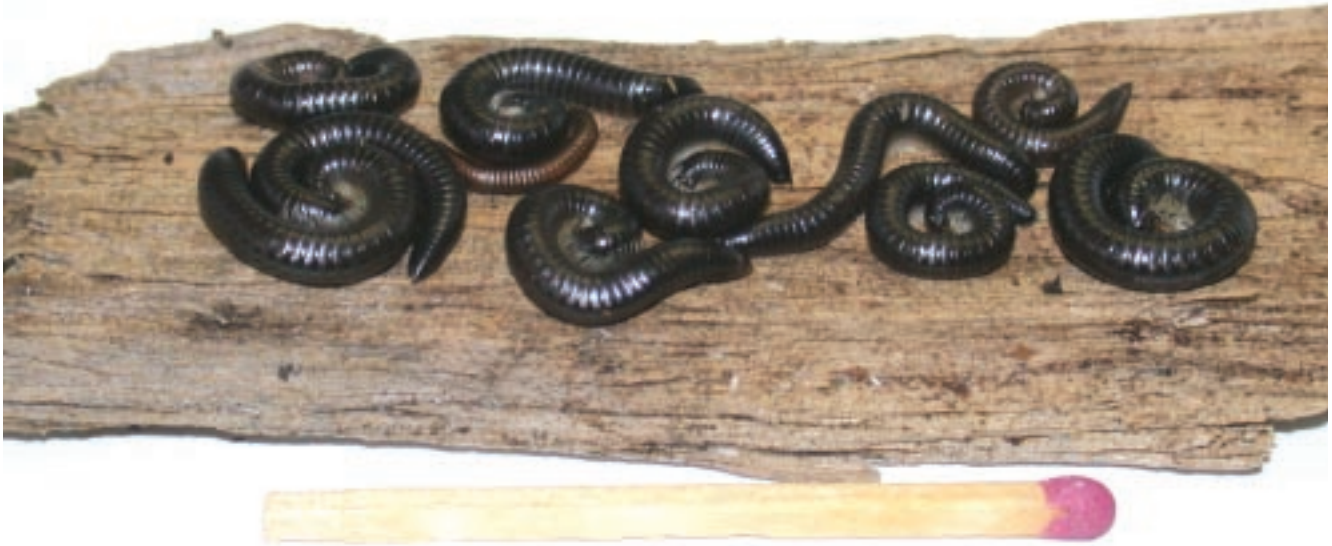
Figure 2. Adult millipedes to scale using a standard match.

After the first year of life, juveniles have reached the seventh, eighth or ninth stage of development and will be about 1.5 cm long. After this stage they will moult only in spring and summer. Portuguese millipedes usually mature after two years when they are in the tenth or eleventh stage of growth and some can live for more than two years.