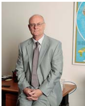
Tim Costello Monday 11 th - 9.15am

Tim Costello is one of Australia's most sought after voices on social justice issues, leadership and ethics, having spearheaded public debates on gambling, urban poverty, homelessness, reconciliation and substance abuse.