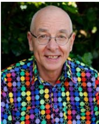
Dr Karl Kruszelnicki

He holds a Bachelor of Economics and completed post graduate research work at the London School of Economics under a British Government scholarship and is a graduate member of the Australian Institute of Company Directors.